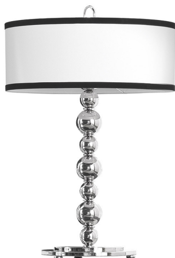
Table lamp with structure in brass and iron. Frame with large spheres. Nickel or gold finishing. Shades with ivory chinette fabric with black fabric details.